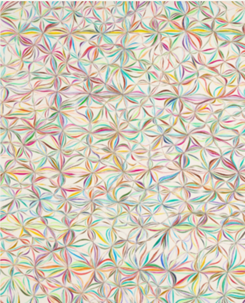
Caetano de Almeida, Murta (2016) ACRYLIC ON CANVAS