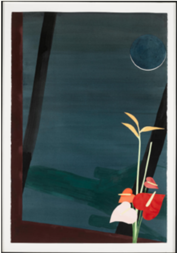
Billy Al Bengston, Ka'ao watercolor (1984) WATERCOLOR AND COLLAGE ON PAPER