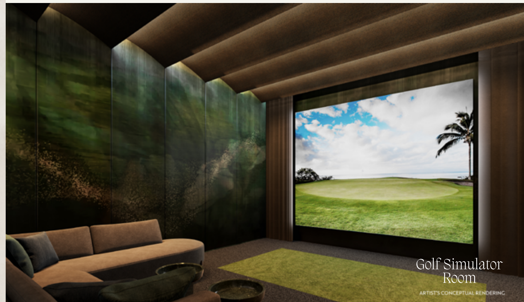
Golf Simulator Room